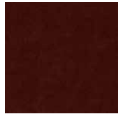
Enchant 404 Henna