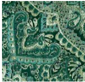
Meera 215 Elm