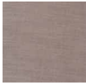
Enchant 858 Cobble