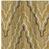
Delta 824 Ochre