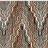
Delta 709 Pecan