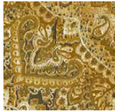
Meera 824 Ochre