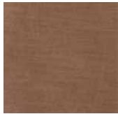
Enchant 806 Camel