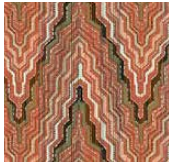
Delta 437 Tuscan Red