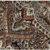
Meera 709 Pecan