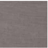
Enchant 971 Nickel