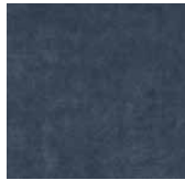
Enchant 122 Wedgewood