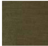
Enchant 243 Cactus