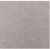
Enchant 919 Zinc