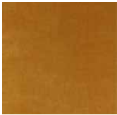
Enchant 301 Saffron