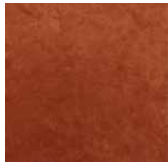
Enchant 408 Terracotta