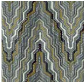
Delta 938 Pewter/Sand