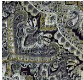
Meera 938 Pewter/Sand