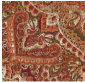
Meera 437 Tuscan Red