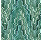
Delta 215 Elm