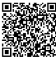
Curtain Base Cloth Qualities