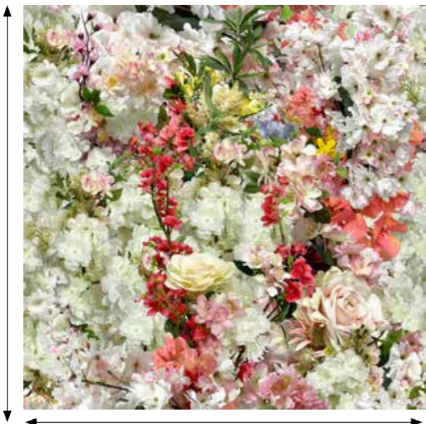
IN BLOOM - Height Repeat: 68.5 cm, Side Repeat: 68.5cm (approx)