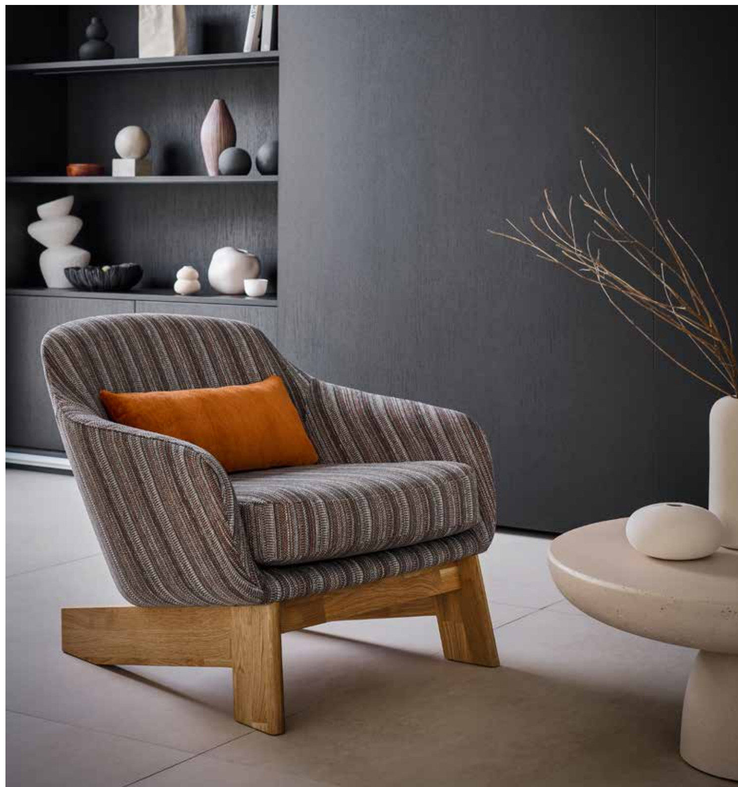
Images Above Upholstered in 568 Grey/Terracotta, Cushion: Gallante 447 Cinnamon. Opposite: 192 Ink, 471 Red, Gallante 837 Stone, 858 Cobble. (Cuttings in dish) 858 Cobble, Gallante 424 Vermillion, Gallante 447 Cinnamon