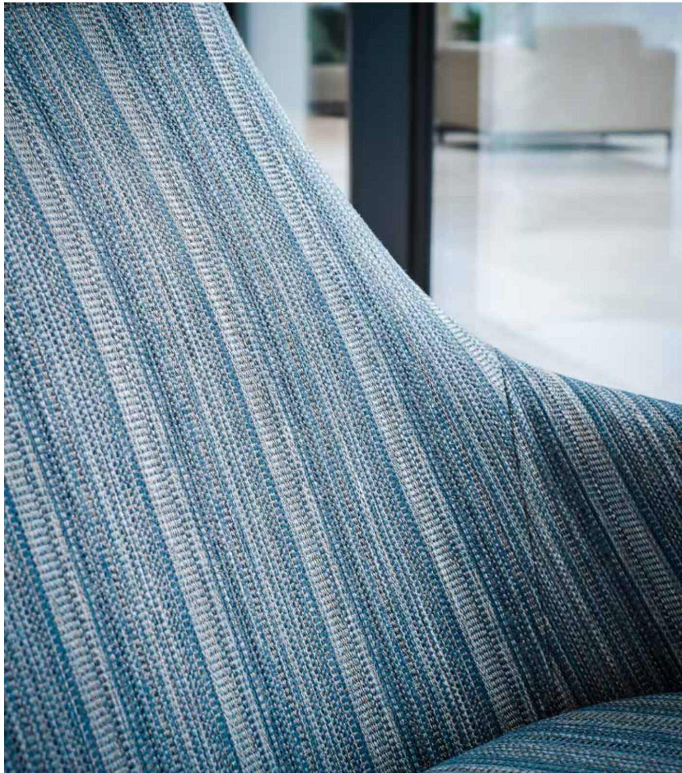
Above Image: Chair: Upholstered in 108 Delph. Opposite Image: Chair: Upholstered in 108 Delph, Cushion: Gallante 108 Delph. Stool: 858 Cobble and Gallante 919 Zinc