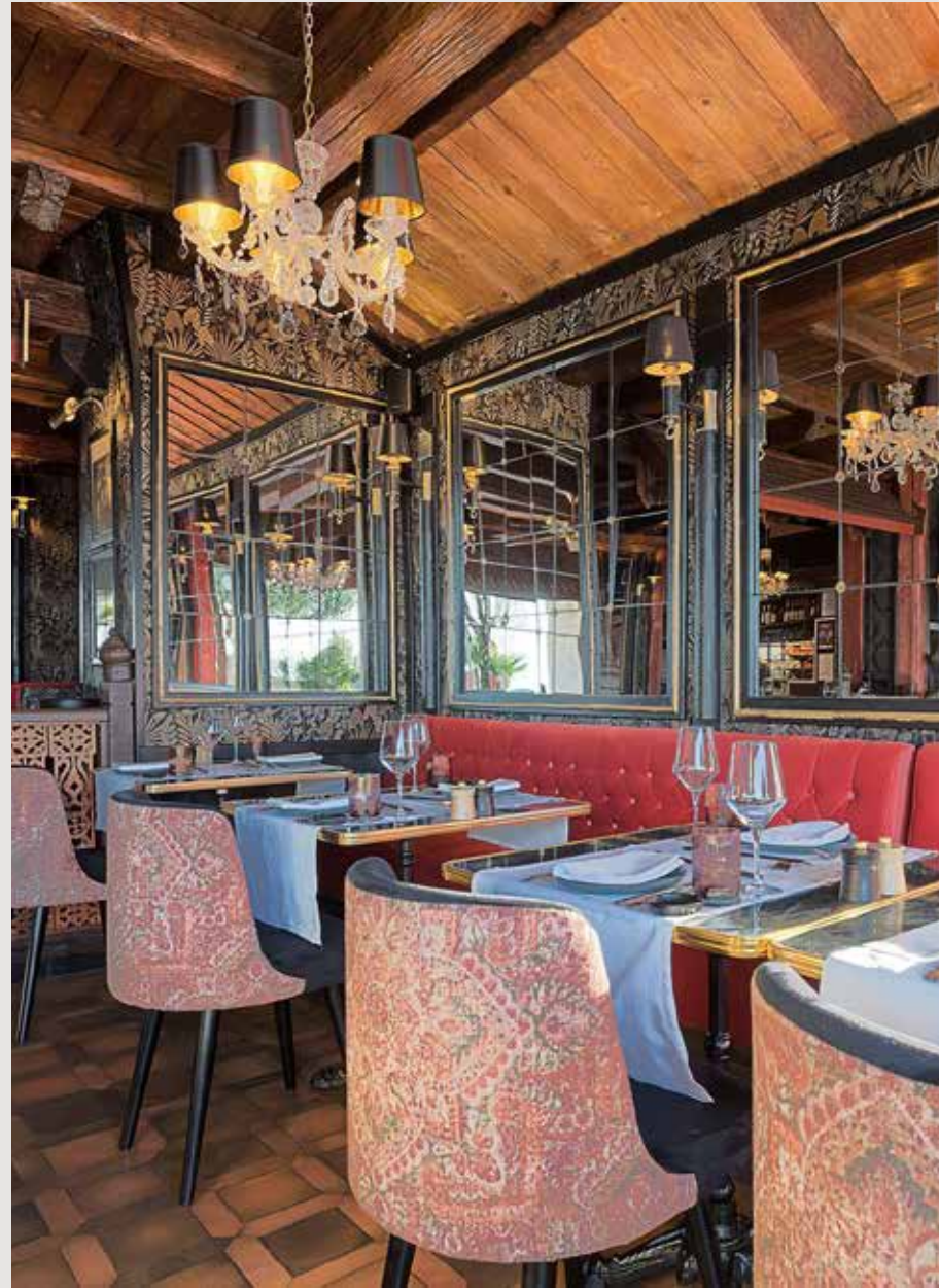
PROJECT: Coco mama, Montreux

PROJECT: Coco mama Montreux LOCATION: Switzerland FABRICS: Meera Velvet | Shalimar