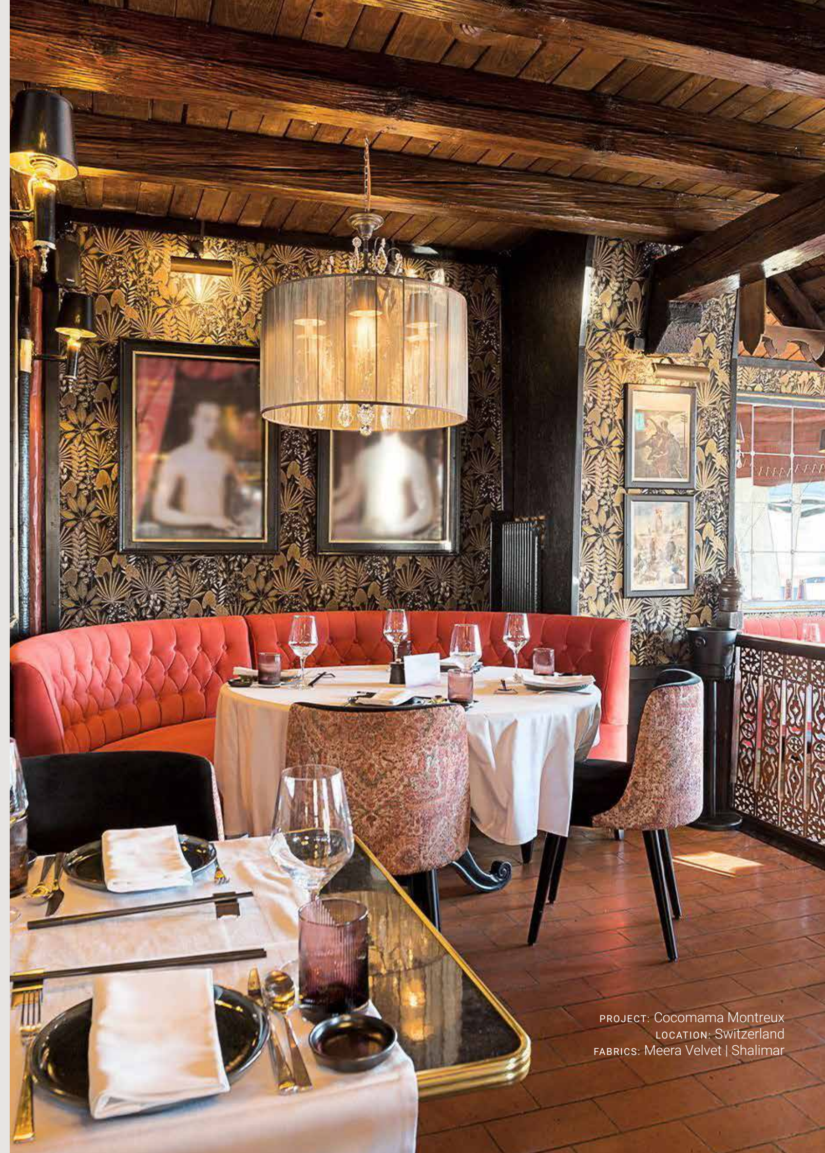
PROJECT: Cocomama Montreux LOCATION: Switzerland FABRICS: Meera Velvet | Shalimar