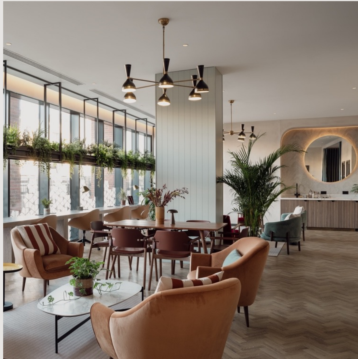
PROJECT: The Barnum Residential

PROJECT: The Barnum LOCATION: Nottingham FABRICS: Allure, Cinnamon