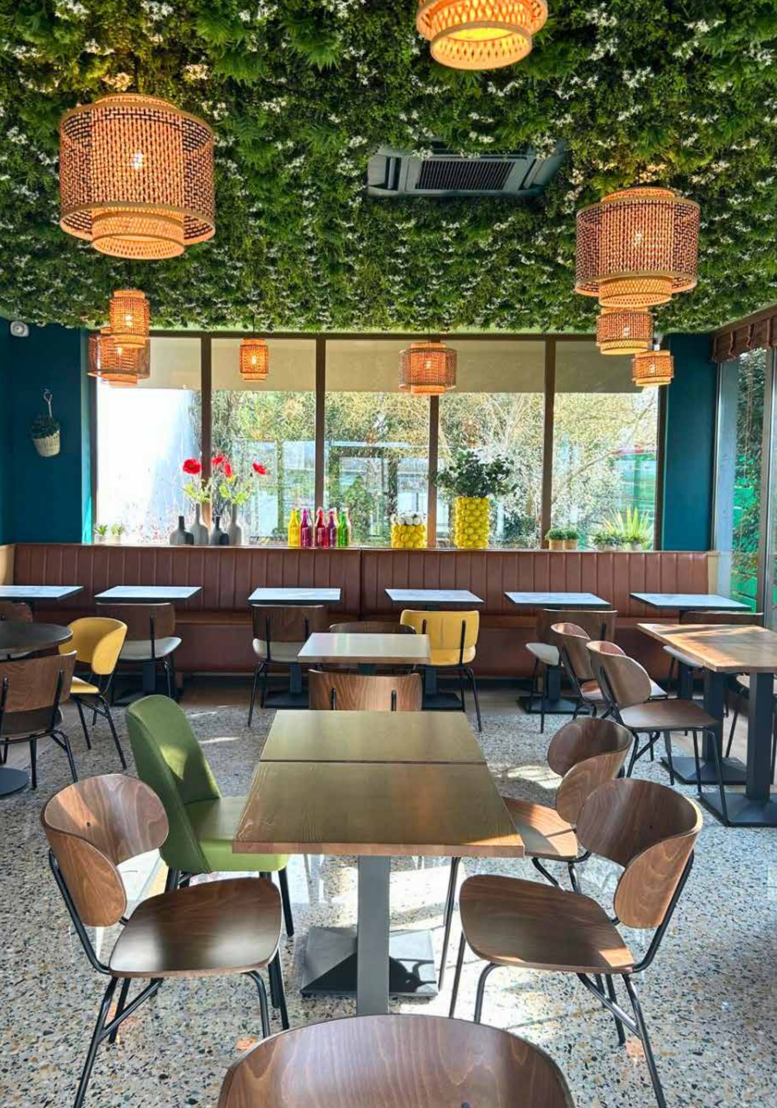
PROJECT: Del Arte Restaurant LOCATION: France FABRIC: Alba, Saffron