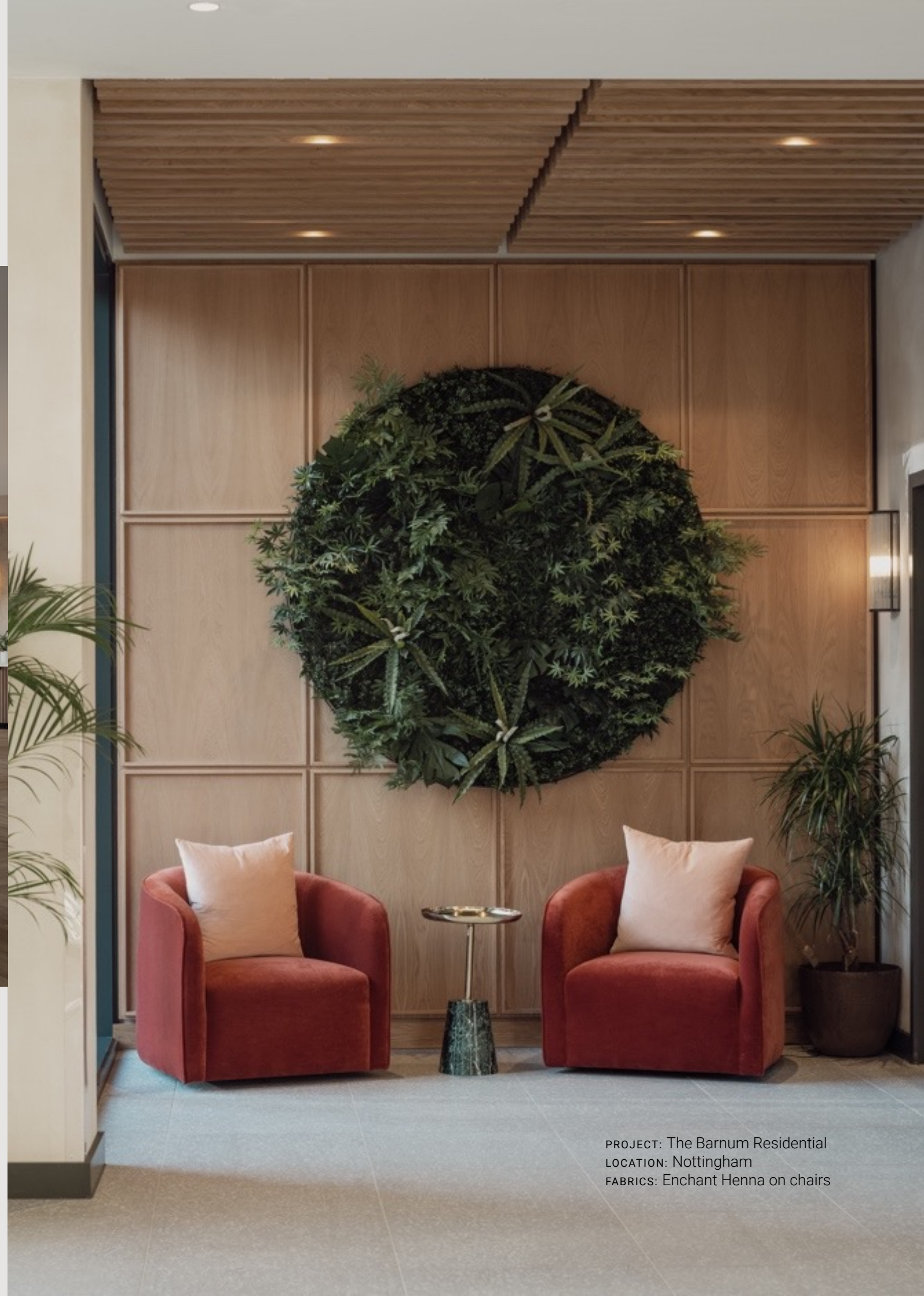
PROJECT: The Barnum Residential LOCATION: Nottingham FABRICS: Enchant Henna on chairs