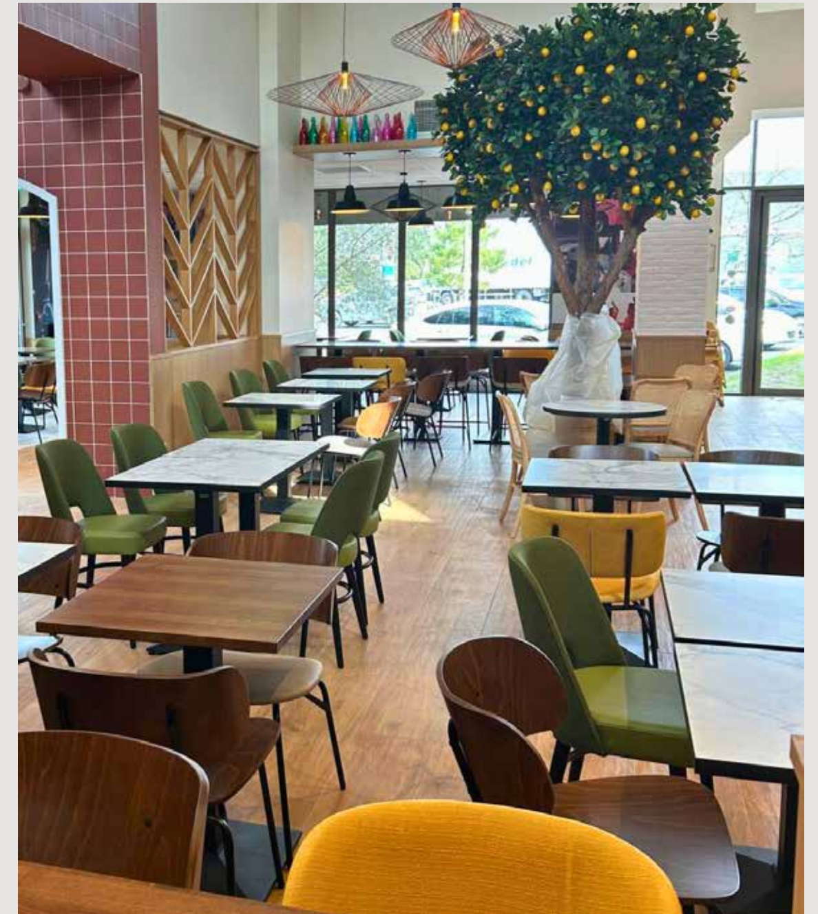
PROJECT: Del Arte Restaurant, France

Our Alba linen-effect upholstery adds a vibrant pop of colour to this beautiful dining space at Del Arte, France. Featured on the upper seating applications in a stand out, high-saturation Saffron colourway, this textured fabric showcases how the right upholstery choice can truly transform a design.