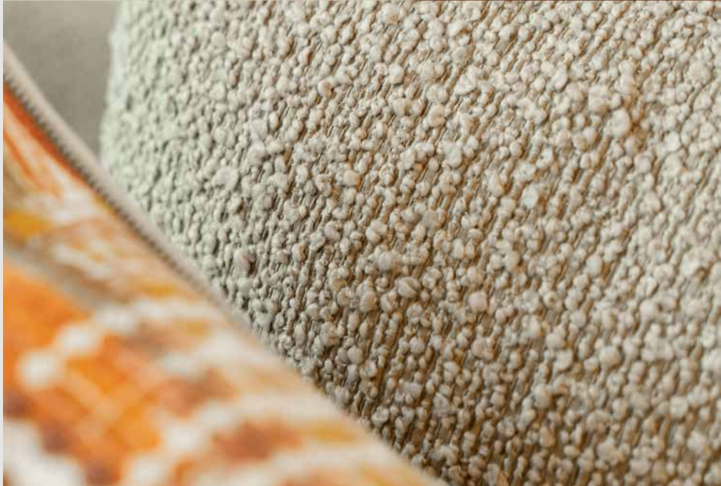
PROJECT: The Castings LOCATION: Manchester FABRICS: Shelby, Noble and Elkie