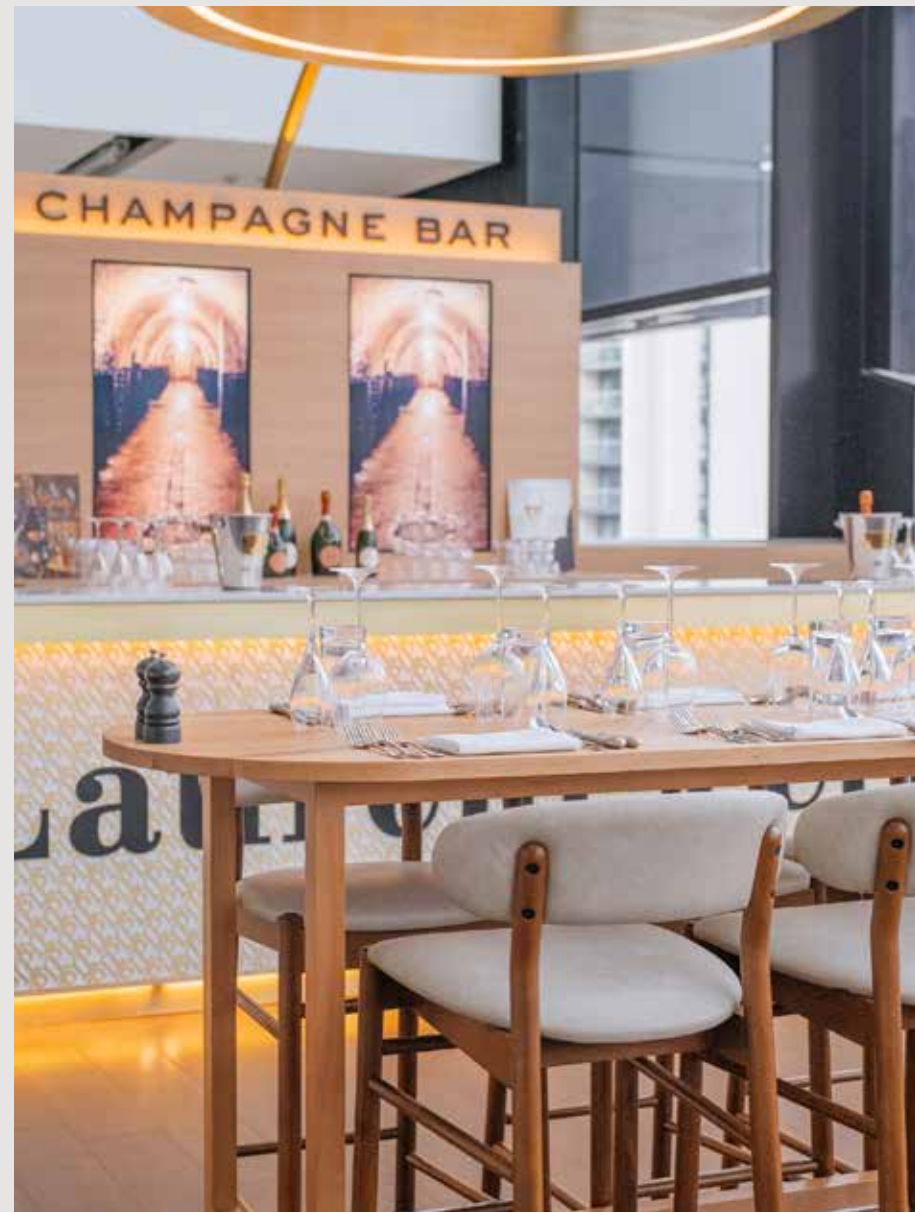
PROJECT: The Laurent- Perrier Champagne Bar

PROJECT: Laurent-Perrier Champagne Bar LOCATION: Wembley Stadium FABRICS: Antique in Chestnut and Hessian