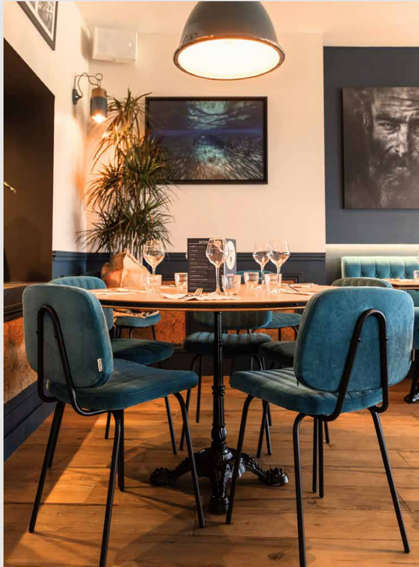
PROJECT: Bar de la Marine LOCATION: Quiberon, France FABRICS: Luxe Performance Velvet in Peacock Enchant in Teal