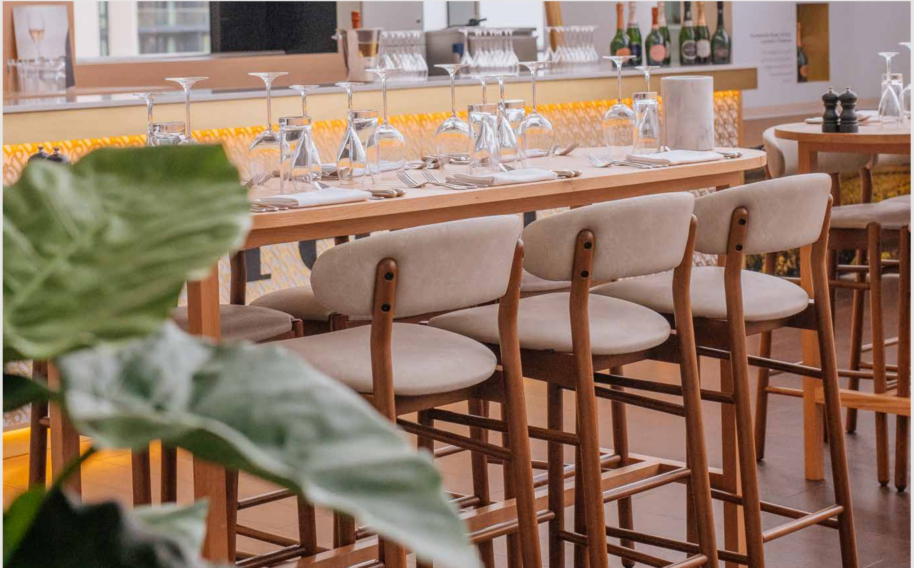
PROJECT: The Laurent-Perrier Champagne Bar LOCATION: Wembley Stadium, London FABRICS: Antique in Chestnut and Hessian