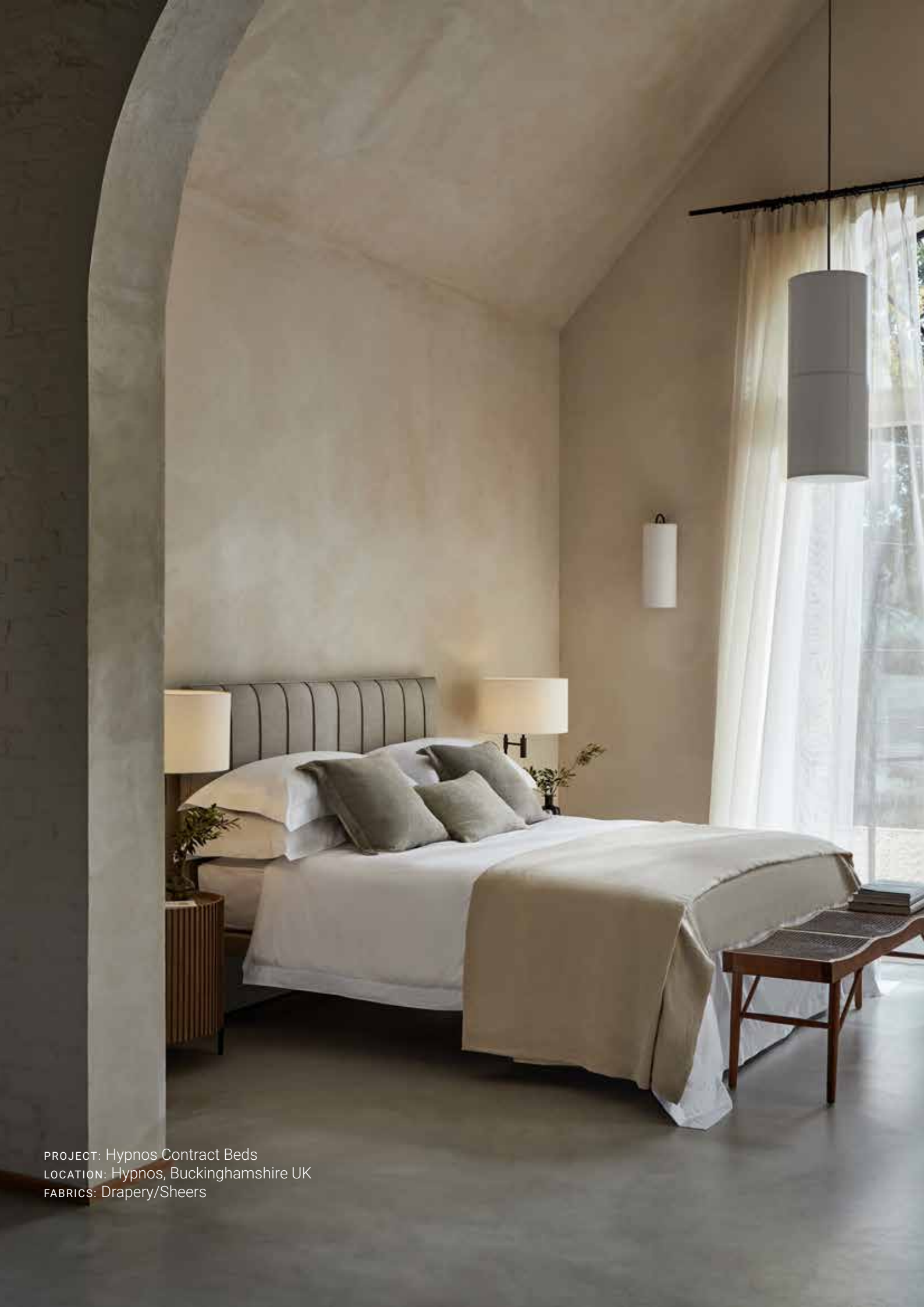
PROJECT: Hypnos Contract Beds LOCATION: Hypnos, Buckinghamshire UK FABRICS: Drapery/Sheers