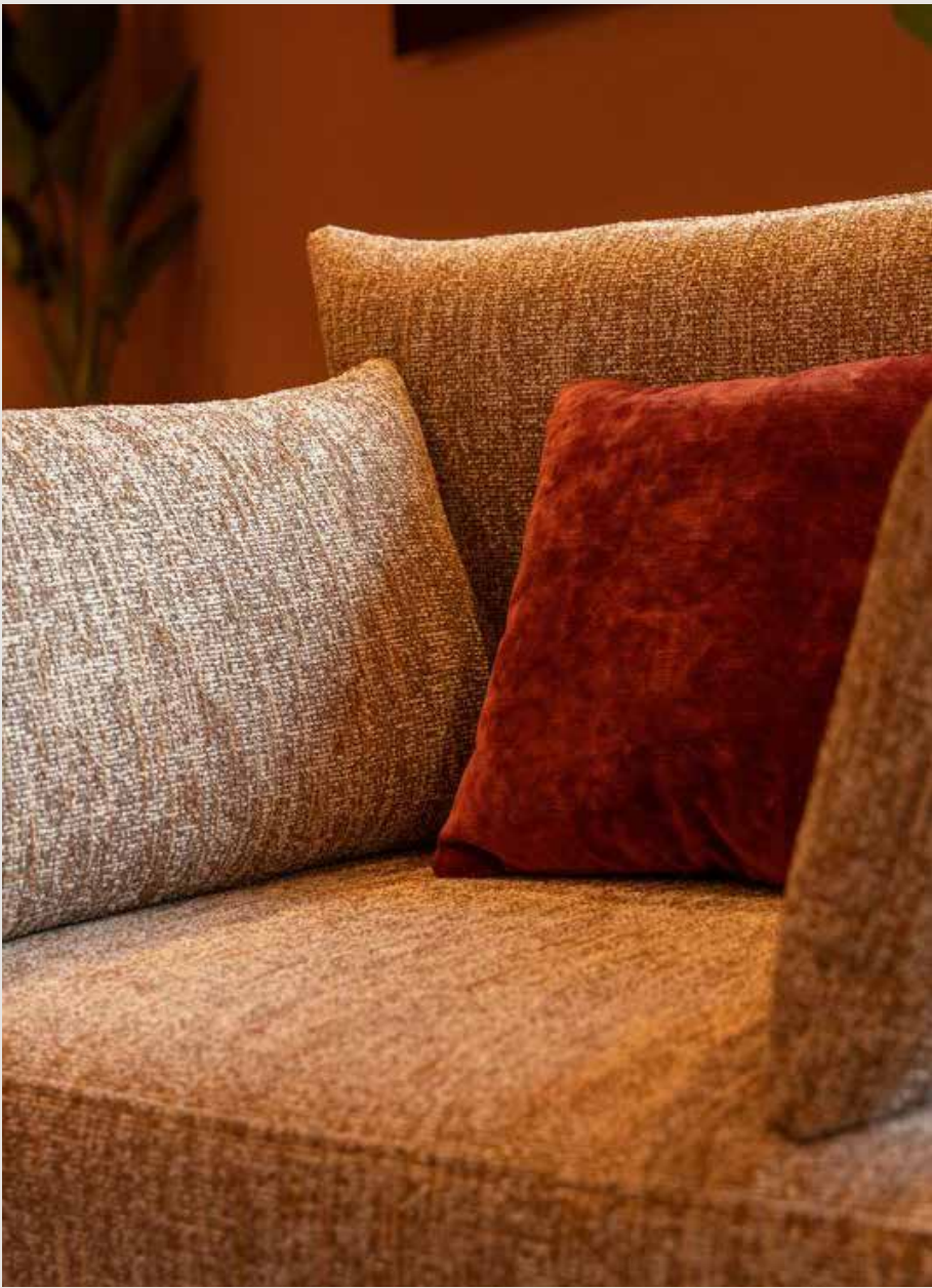
PROJECT: The Castings Residential

A true masterclass in texture and tone, this expertly curated design showcases a refined selection of our fabrics. Our Shelby upholstery, in a muted Camel hue brings timeless elegance to the sofa, while our Noble velvet in a bold Ochre colourway adds a luxurious, velvety richness to the bar stools.